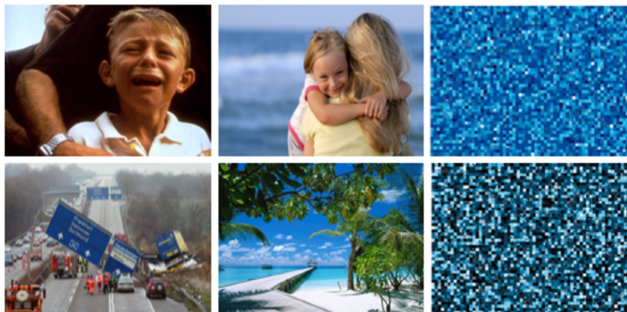
Fig. 1 Example of stimuli. Left of right: negative, positive, and blurred. Top panel: social, bottom panel: non-social

Structural and functional images were acquired using a Siemens Prisma 3 T scanner at the Geneva Center for Biomedical Imaging (CIBM). The acquisition protocol for the structural sequence was a 3D volumetric pulse sequence with TR = 2500 ms, TE = 3 ms, flip angle = 8°,